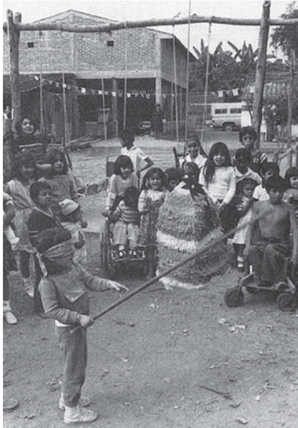
A community rehabilitation program finds enjoyable ways to bring disabled and non-disabled children together. Here the village children have been invited to the birthday party of a disabled child. They take turns, blindfolded, trying to break a 'piñata' (a papier-mache toy filled with candy and nuts).

It must be remembered that opportunities for a close, loving relationship are only one aspect of leading a full, accepted, and participating life in the community. The more that can be done to bring about greater integration and participation of disabled persons in the life of the community, the more everyone will learn to look beyond a disability and see the person. When this happens, it opens up many new possibilities.